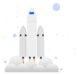
Fast paced learning